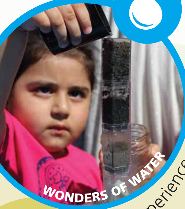
WONDERS OF WATER